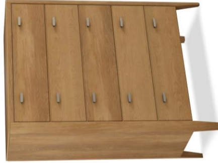
257-155 5 Drawer Chest 40" L X 20" D X 54" H