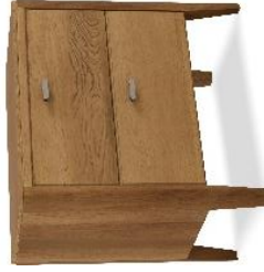
257-202 2 Drawer Night Stand 28" L X 18" D X 28" H