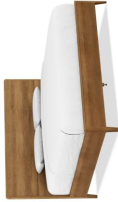
257-144 King Low Wood Panel Bed 82" W X 85 1/4" L X 54" H 257-124 Queen Low Wood Panel Bed 64 1/2" W X 85 1/4" L X 54" H