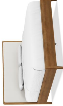
257-143 King Low Upholstered Panel Bed 82" W X 85 1/4" L X 54" H 257-123 Queen Low Upholstered Panel Bed 64 1/2" W X 85 1/4" L X 54" H