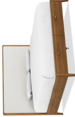
257-149 King Upholstered Panel Bed w/Footboard Storage 82" W x 85 1/4" L x 60 3/4" H 257-129 Queen Upholstered Panel Bed w/Footboard Storage 64 1/2" W X 85 1/4" L X 60 3/4" H