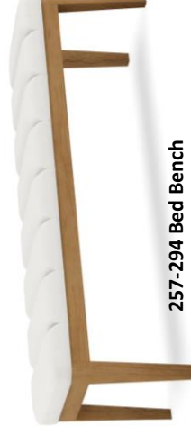
257-294 Bed Bench 60" L X 17" D X 18 1/2" H