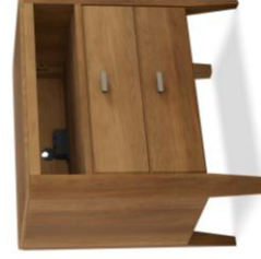
257-201 Open Night Stand 28" L X 18" D X 28" H Charging Station