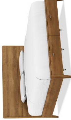
257-148 King Low Panel w/Footboard Storage 82" W X 85 1/4" L X 54" H 257-128 Queen Low Panel w/Footboard Storage 64 1/2" W X 85 1/4" L X 54" H