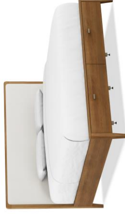
257-146 King Low Upholstered Panel Bed w/Footboard Storage 82" W x 85 1/4" L x 54" H 257-126 Queen Low Upholstered Panel Bed w/Footboard Storage 64 1/2" W X 85 1/4" L X 54" H