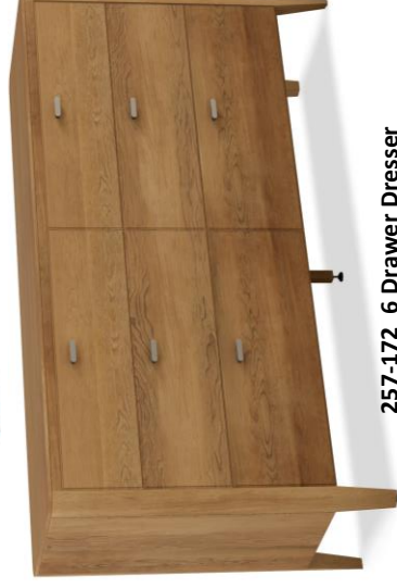
257-172 6 Drawer Dresser 68" L X 20" D X 37 3/4" H