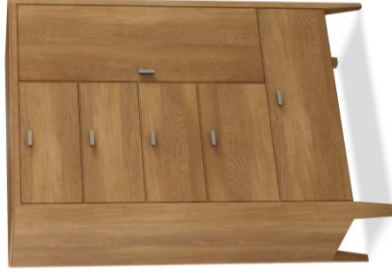
257-162 Gentlemen's Chest 41 1/2" x 20" D x 61" H